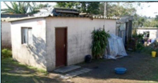
HOUSING PROJECT - We are desiring to build an addition to a house of one of our church members living in a very disadvantaged community. Six people live in this tiny house. The project hit a snag and lost a bit of momentum. Pray that God will provide the resources and get the ball moving again!