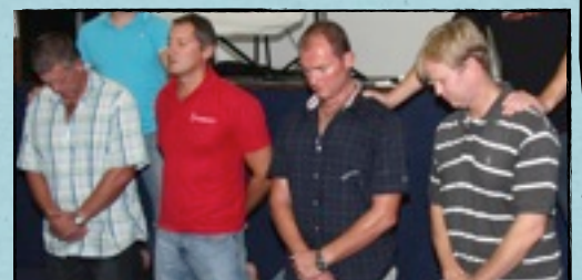
LEADERSHIP DEVELOPMENT - In January we commissioned four deacons. By April, we lost one due to a crazy work schedule. Pray for the others as they too battle time management.